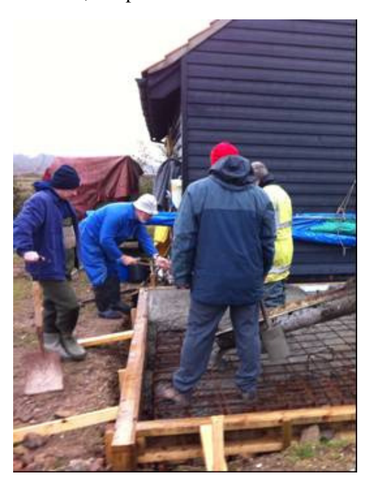
starting off and making sure it's right!

With everybody working flat-out, the formwork was soon filled level with concrete, tamped and left to set.