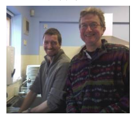
just like being at home!

themselves, which were hit by wooden spoons attached between their knees! Imagine that ladies (or not!) Sadly no photographic evidence could be found - we were clearly enjoying it too much!