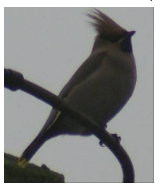
and up the telegraph pole!