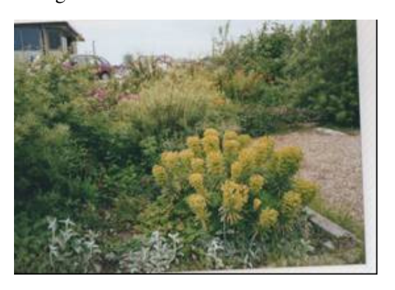
now you see them

Some members, having been witness to the original site of the club, might be asking why the vegetation has been removed. Many have volunteered for gardening duty, in 'hard-working-parties', over the last few years and seen the growth of shrubs and other plants around the perimeter. The need for the removal of woody vegetation from seawalls has been explained by the Environment Agency in relation to Essex-wide work on the tidal defences. The washing away of bare earth beneath vegetation would reduce structural strength in the event of a surge-tide and the associated winds could uproot larger bushes, leaving a hole compromising the strength of the embankment.