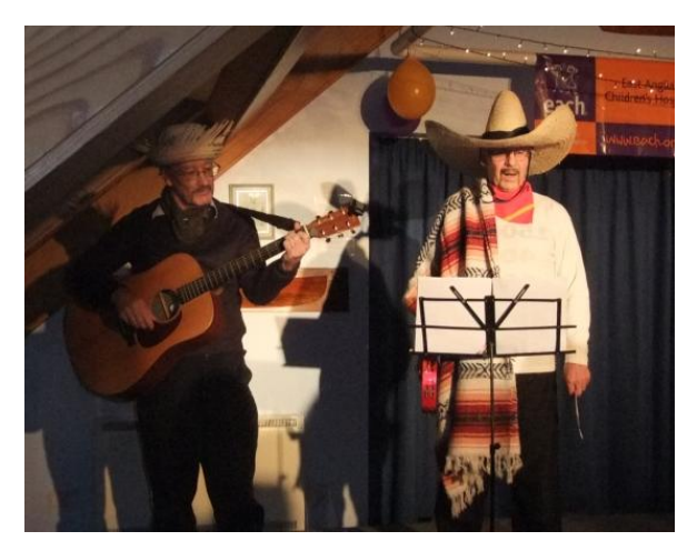
Olé! los dos amigos