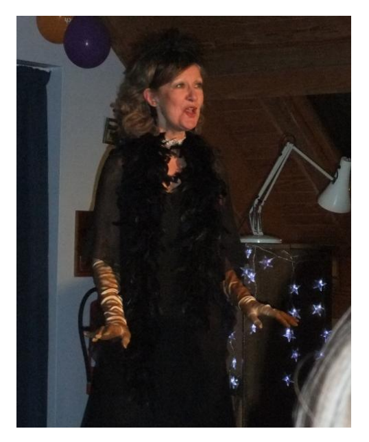
but the boa didn't constrict her?