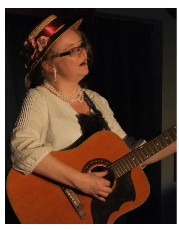
a strolling minstrel (chocolate centred)