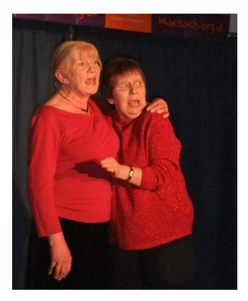
sisters are doin' it for themselves