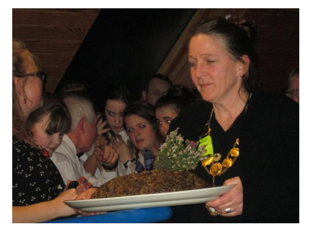
"...and here's the famous pudd'n"