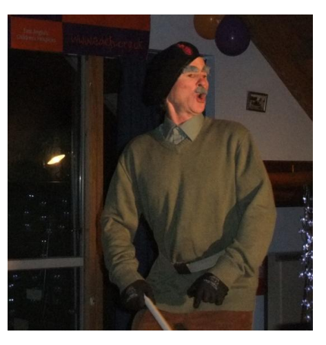
you at the back, liven up you 'orrible lot