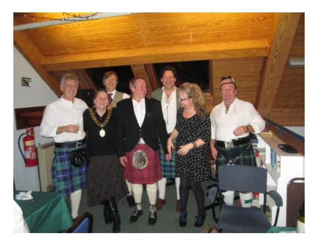
'all together now 'knees up mother br..'