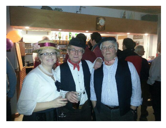
shunt tha bi roun' back clearin t'drain