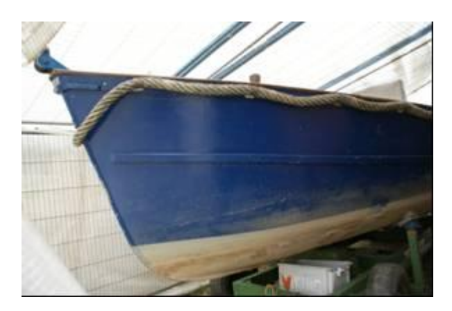
nice little undercover job for anyone?

Kevin closed the meeting, reminding us to ensure trailers were fully functional and added a word of encouragement to all members for the scale and proficiency of this group activity over the years since its inception.