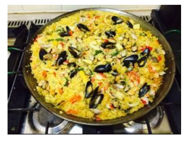
a tasty sea-food paella

The food included a wonderfully tasty range of starters, tapas and paella (the latter prepared by our Commodore – a man of many talents).