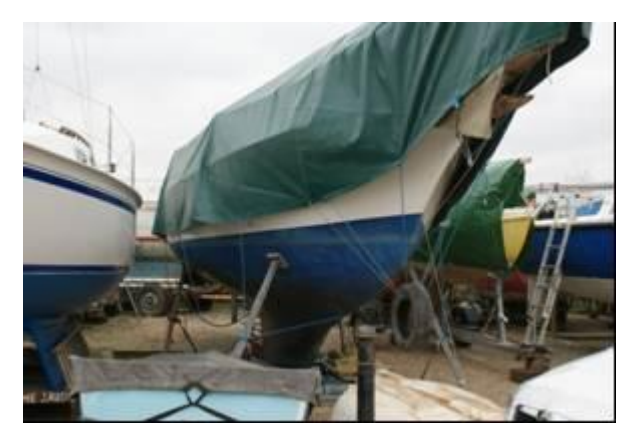
anybody ready for launching?

Kevin closed the meeting, reminding us to ensure trailers were fully functional and added a word of encouragement to all members for the scale and proficiency of this group activity over the years since its inception.