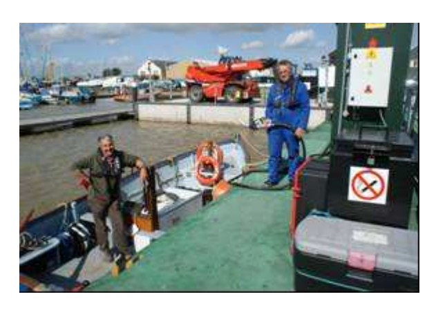
using the quayside service

Getting the fuel, turned out to be very straight-forward, having notified the harbour office, we were met at the pumps and had our requirements delivered by a most helpful official in attendance.