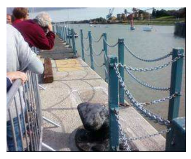
anything happening?

The barrier staff provided information by way of presentations, displays and demon-