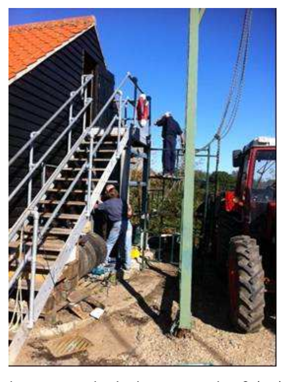
done, now what's the next project? (AR)

The calendar with next year's events has been completed as shown earlier in the newsletter (although if you are keen to add anything please let me know!).