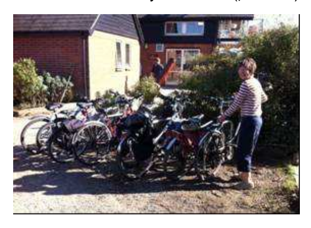
yes - is this one mine?