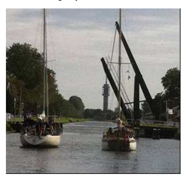
Vital Spark and Tara make for Goes

After negotiating several more locks, we arrived at our destination and, after a bit of nifty boat handling from both boats and crews, we managed to shoe-horn ourselves in. We arranged to meet up with other sailing club members and after a bit of discussion, over a beer or two, found ourselves planning our return to the UK. Where had the time gone? The following day saw us heading back through the canal system to Flushing, whilst gathering weather reports; it looked as though the strong winds we had been experiencing were starting to calm! After one last evening on foreign shores and a very enjoyable drink, we set sail for the UK, early the following morning. Lumpy seas and grey skies eventually gave way to calmer and brighter conditions. We arrived