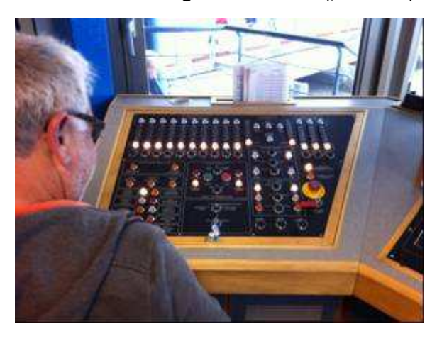
the nerve centre