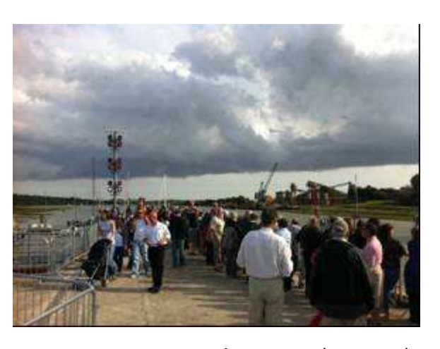
a good turn-out