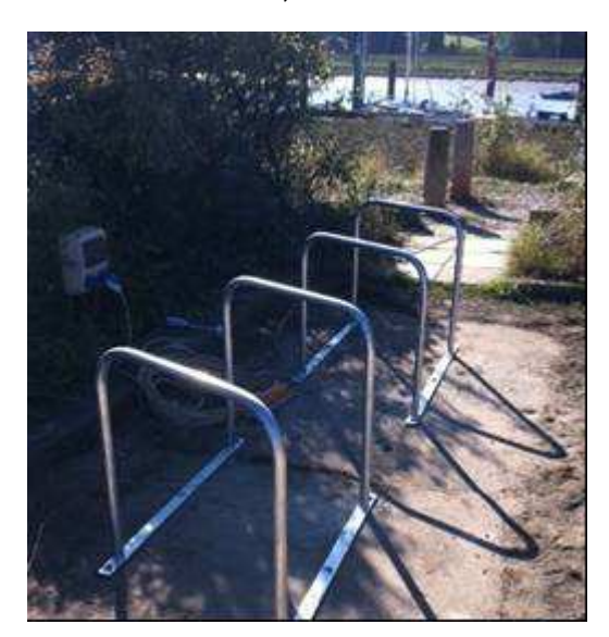
but will they catch on?