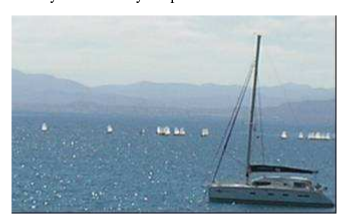
sailing school - out in the straight

Most days we saw a flotilla of some 40-odd small identical sailing dinghies, heading out from and back to, the sailing school, with a number of safety craft in attendance. Then back up the club ramp in procession, like a conveyer belt -ready for post London 2012?