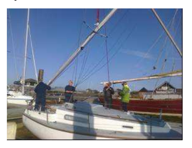
is that it then?

The rig consisted of a tripod structure of thick-walled alloy tubes, which had been demonstrated in a scaled model. The benefit of such a facility, able to lift masts on boats afloat (or aground!) prior to recovery or after launching, would be increased by use for enabling emergency repairs to be made, in the summer months.