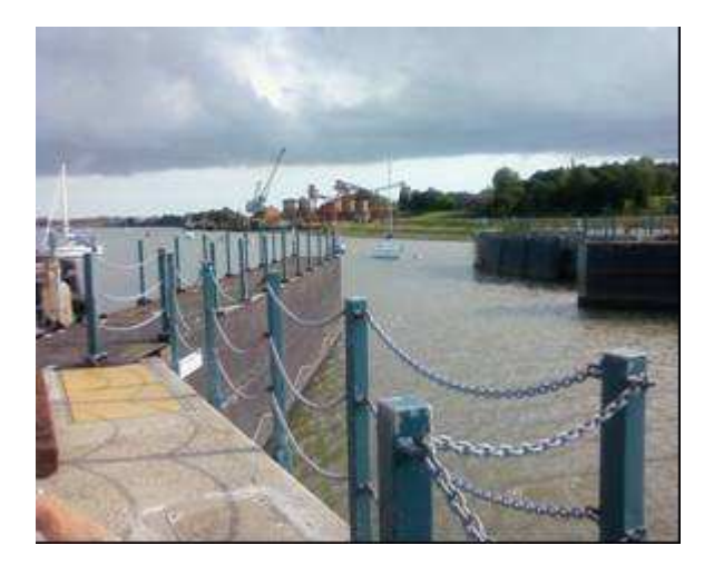
yes there it goes

strations of, eg. notional flood levels and even made a well appreciated closure of the moving gates, readily observed by the many visitors on top (behind the railings) and some of our sailors at sea-level.