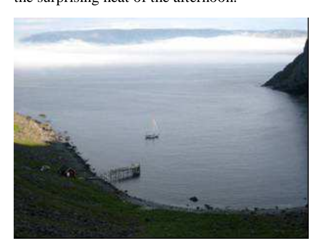
Hornvika, North Cape - fog coming in

The North Cape (Nordkapp) is a fine, bold headland with a 1000 foot vertical cliff, well north of the tree latitude and the only living things to be seen were the reindeer, grazing like mountain goats. We made it on 9 July, after 54 days and 2126 miles on the log. At 71 deg. 11 min. N we were 1100 miles from the North Pole and 1300 as the crow flies from home. Ironically it was a clear, sunny and very warm day and we anchored in the deep bay of Hornvika just beyond the Cape. This was where tourists were brought in the old-days; nowadays the cruise ships go to the port of Honningsvag and the passengers are bussed to the headland. Our crew were offered the old route and struggled up the old path in the surprising heat of the afternoon.