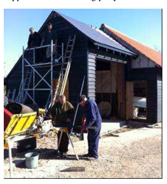
that should do it

Then there was the immensely well supported 'hard-working party' in October