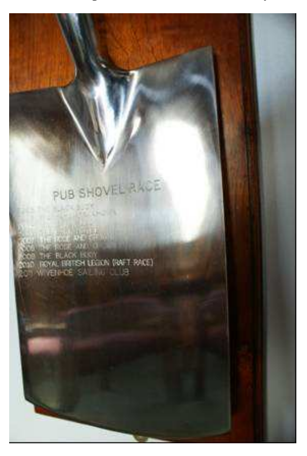
yet another trophy!

The summer has been a big success, with many club functions, help from volunteers and making links with other local clubs, which we hope will continue into next year.