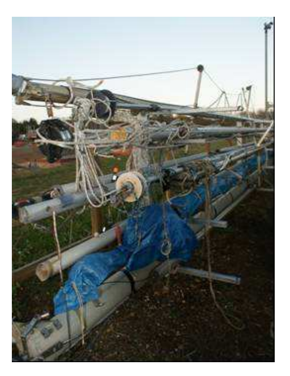
mast-rack, isn't that in Holland?

Finally, for those of you who could not be present at the annual dinner, I would like to 'take wine' with everybody who has helped, at functions/ behind the bar/ with lettings over the summer! It's only possible with your help!