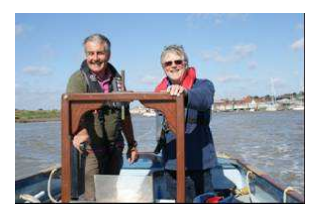
leaving Wivenhoe on Viking

With the opening this year, of the new Brightlingsea Harbour fuel supply service on the quay-side, near Morgan's Marina and next to the Pioneer Trust premises, we were able to test out the feasibility of collecting fuel for Viking and the club boatlaunching and lifting activities, by sea using Viking .