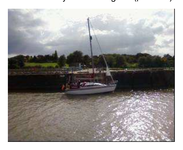
better get a move on!