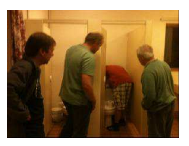
flushed with success?

The open day was a great event, when members and visitors turned out in force to visit the club and take advantage of viewing the barrier. The sun shone and some visitors were given river trips on members' boats, getting a different perspective, as they sailed through the barrier.