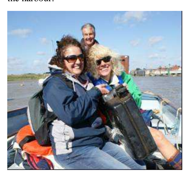
with helping hands

ember, a bit choppy but a lovely day. So we took Viking from the mooring and loaded all the diesel cans and headed down river. Nevertheless we were all pretty well wetthrough, from spray by the time we got into the harbour.