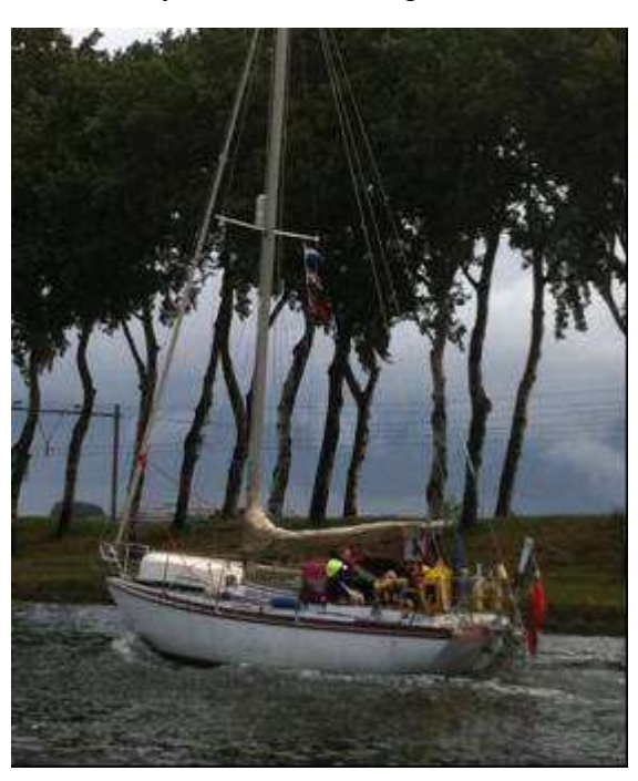
Tara making way

The following day we took the train into Brugge, with both Tara and Vital Spark's crew and enjoyed a relaxing afternoon, before heading back to Ostende. Monday morning saw a wet and early start as we headed along the coast to Flushing and into the canal system, via the huge sea lock.