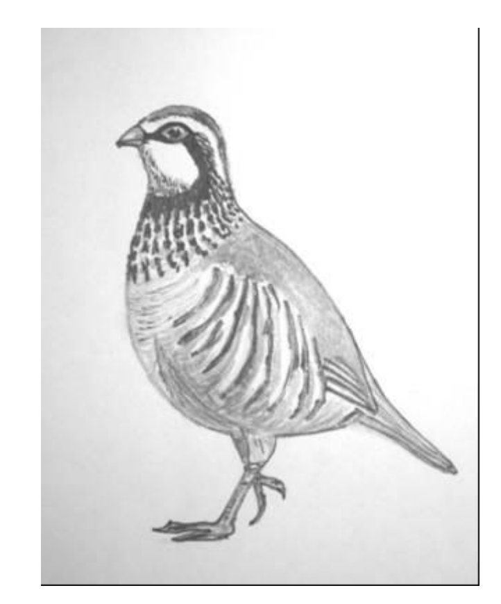
the red legged partridge (Gill Maloney)

The bird is most often seen in the eastern counties now but a few are seen as far away as the south coast and the Welsh border. It is interesting to note a count in 1950 when the red-legged partridge was out-numbered by the grey partridge by 20:1. It is now the commoner species! Maybe this is not surprising when annually 800,000 are released and 400,000 are shot in Britain. The released birds run around open farmland for the field sportsmen's sport. In season they can go out and shoot their own Christmas or Sunday dinner.