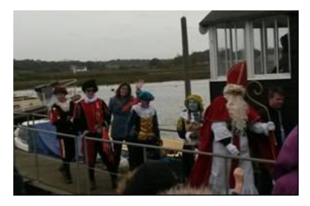
is this the Wivenhoe custom shed?

moored at the sailing club and from there he made the voyage to the town Quay; it was a very high tide but luckily the barriers opened just in time!