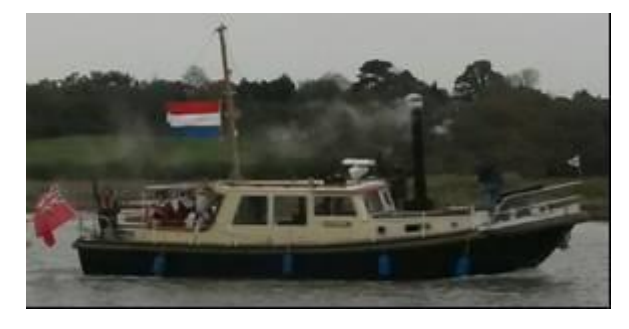
who's that with a white beard sailing on the River Colne?

A foreign vessel is sighted nearing Wivenhoe!