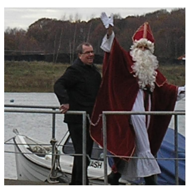
Sinterklaas is greeted by the minister

A very important visitor made a surprise stop at Wivenhoe quay on Saturday 3<sup>rd</sup> December. Fortunately quite a crowd were there to