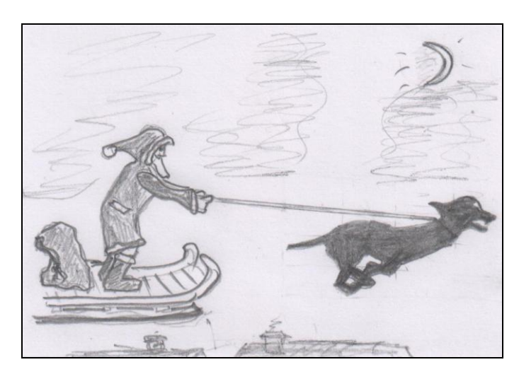
"thanks for helping out; I really appreciate it – what's your name?"