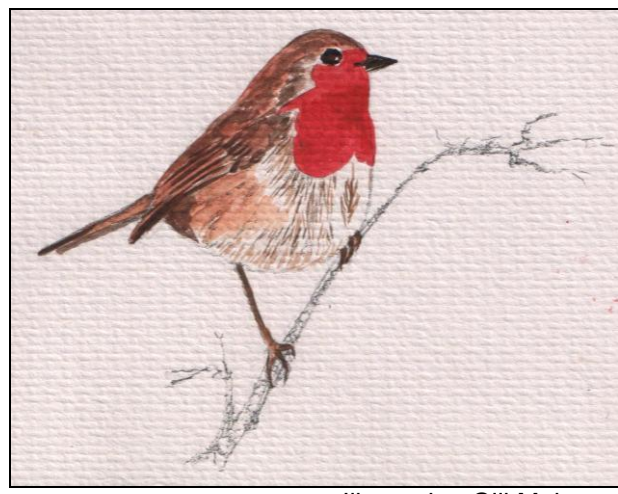
Illustration Gill Malone