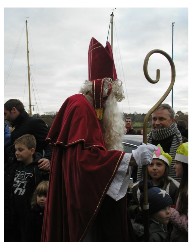
who's a big hit with the public?

witness the sighting, including civic dignitaries and the local resident vicar. His helpers were seen to be distributing goodies from small sacks. Then he disappeared as quickly as he had appeared and was sighted shortly afterwards in Rowhedge by a sizeable crowd.