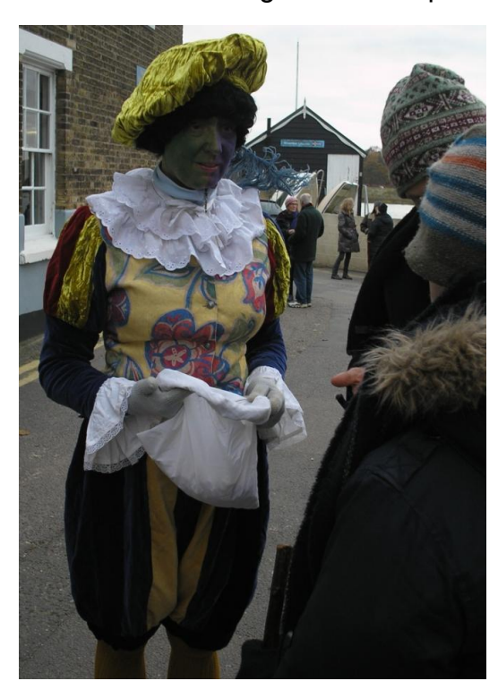
that takes the biscuit!