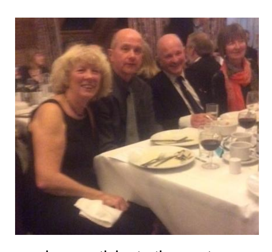
members anticipate the next course