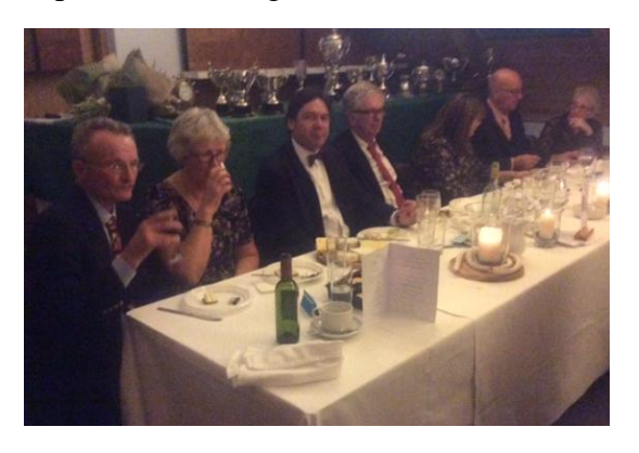
top-table guests taking a toast

The annual dinner was, as usual, a great success, with good food and music provided and a festive atmosphere created, for the bumper turn-out of guests and members.