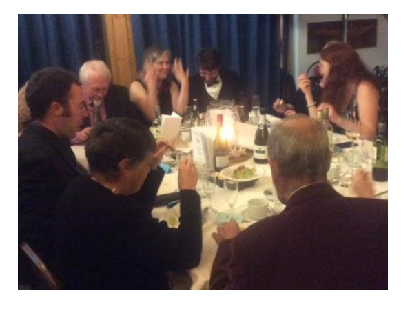
hands-up for seconds