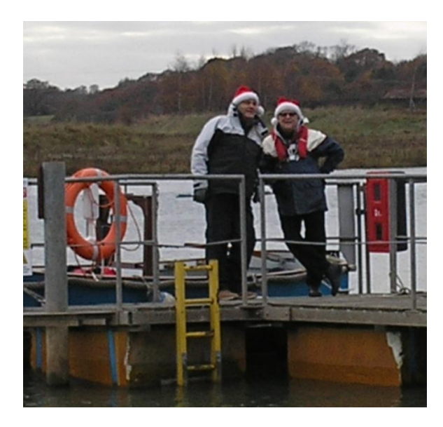
all in a days work for Santa's little helpers

Crew members of SCV Viking were at hand to assist with water-bound transport should it be necessary, in the event of a sleigh malfunction or a reindeer injury.